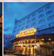
林芝 4★ 峨山大酒店或同级 x 2晚