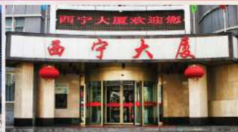
西宁 4★ 西宁大厦或同级 x 1晚