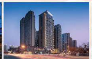
成都 5★ 瑞廷西郊酒店或同级 x 1晚