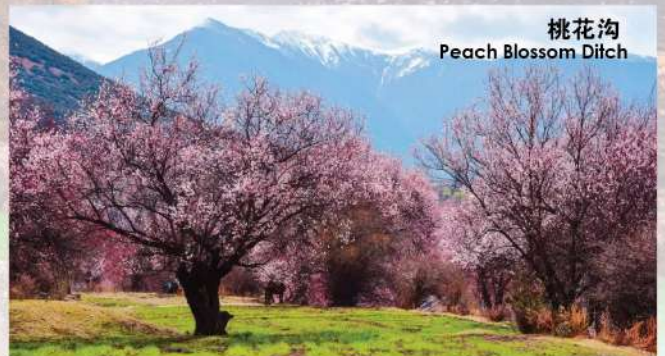
桃花沟 Peach Blossom Ditch

▶ 早餐后游览 桃花沟 ，林芝桃花沟在林芝县东南方向，在嘎拉村和达则沟之间。林芝桃花沟之所以出名，就因其有一片天然的野生桃林，这样的景象在藏区是很难看到的。桃花盛开在每年的3月，此时寒意未尽，娇嫩的桃花在皑皑雪山下却显得格外的柔媚。宛若世外桃源，又似人间仙境；使你流连忘返，魂牵梦萦，不知是天上还是人间。随后游览-- 鲁朗林海 ，鲁朗藏语意为“龙王谷”，也是“叫人不想家”的地方，是我国面积最大、保持最完好的第三大林区。绿水青山的鲁朗离不开大山的怀抱、雪山、森林，构成了与众不同的自然景观，它是西藏的另一种风景；远观世界第十五高峰--南迦巴瓦峰的魅力还在于集壮丽与秀美于一身(2005年曾被《中国国家地理杂志》当选为中国最美的山峰之首)！返回林芝。(200km 5小时左右)