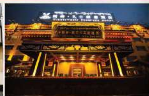
拉萨 5★ 扎什顿章酒店或同级 x 2晚