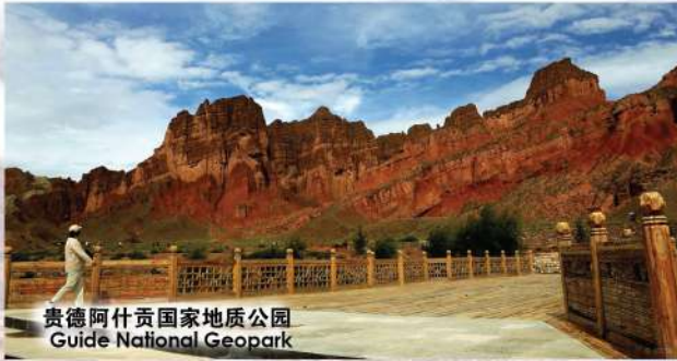
贵德阿什贡国家地质公园 Guide National Geopark

▶ 早起乘坐旅游车至西宁。抵达西宁后，前往黄河发源- 贵德阿什贡国家地质公园 ，多种多样的地质遗迹反映了地质历史时期青藏高原的演化过程，也记录了黄河的发育史和贵德自然环境的变迁。贵德阿什贡国家地质公园被誉为“高原小江南”。