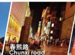
春熙路 Chunxi road