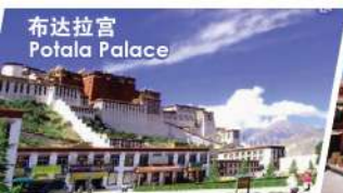
布达拉宫 Potala Palace