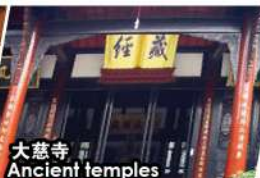
大慈寺 Ancient temples