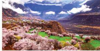
桃花沟 Peach Blossom Ditch