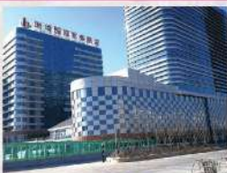
兰州 5★ 瑞岭国际酒店或同级 x 2晚