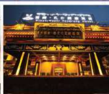
拉萨 5★ 扎什顿珠酒店或同级 x 2晚