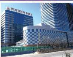
兰州 5★ 瑞岭国际酒店或同级 x 2晚