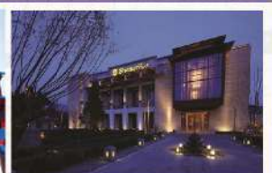
拉萨 免费提升一晚入住国际 5★ 香格里拉酒店 x 1晚