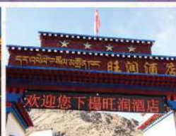
日喀则 4★ 旺润国际度假酒店或同级 x 1晚