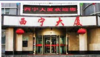
西宁 4★ 西宁大厦或同级 x 1晚