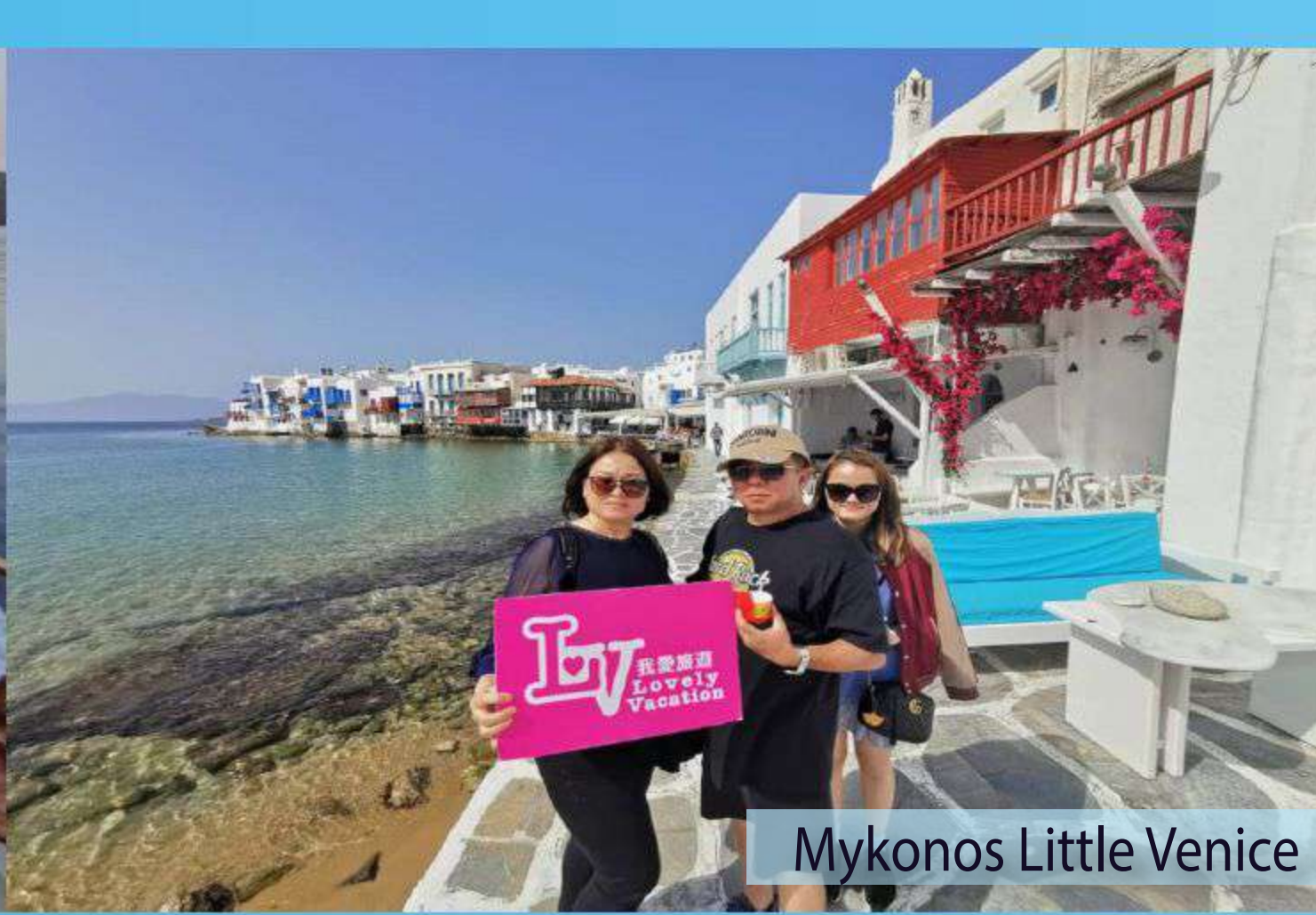
Mykonos Little Venice