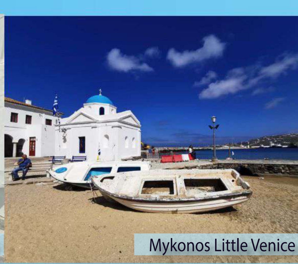
Mykonos Little Venice