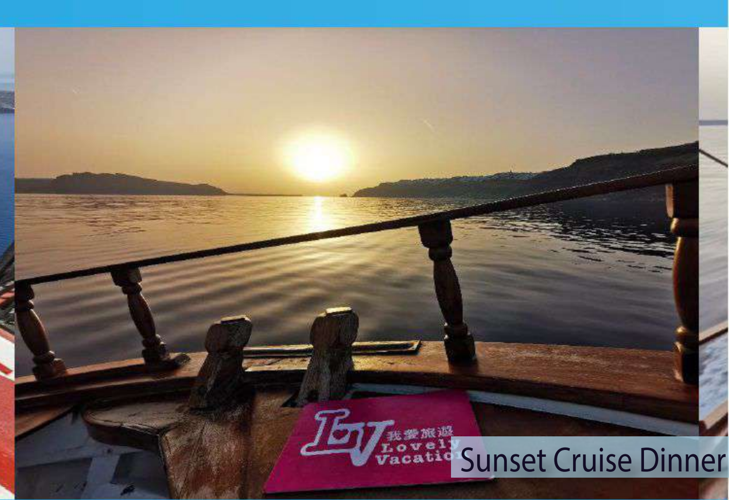
Sunset Cruise Dinner