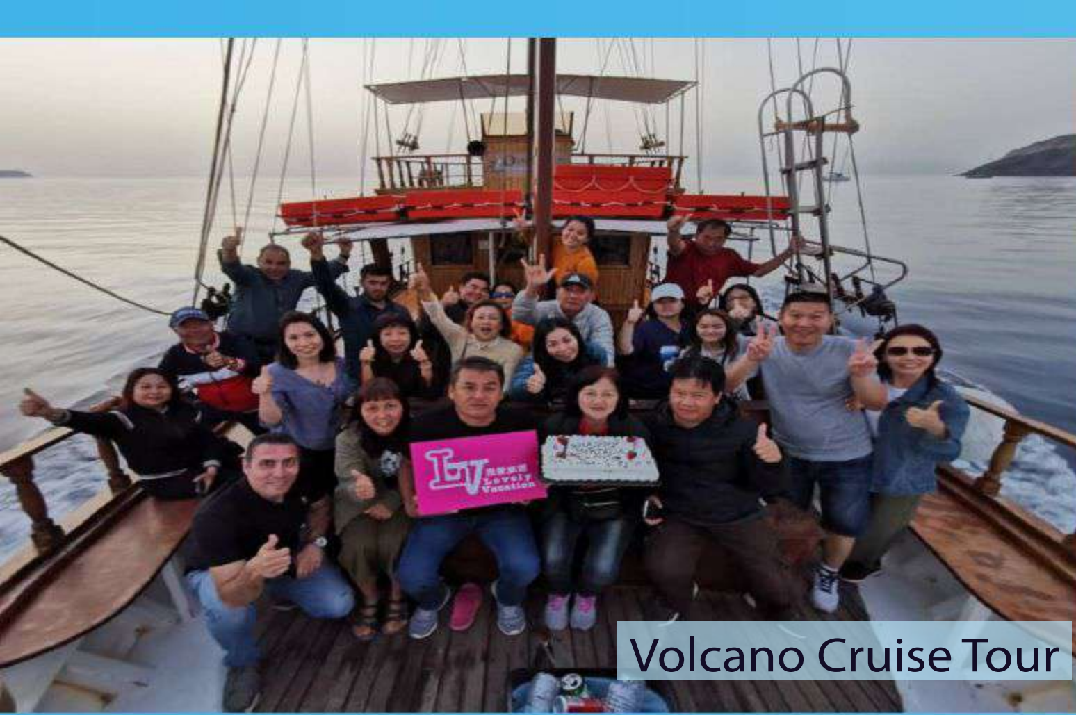
Volcano Cruise Tour