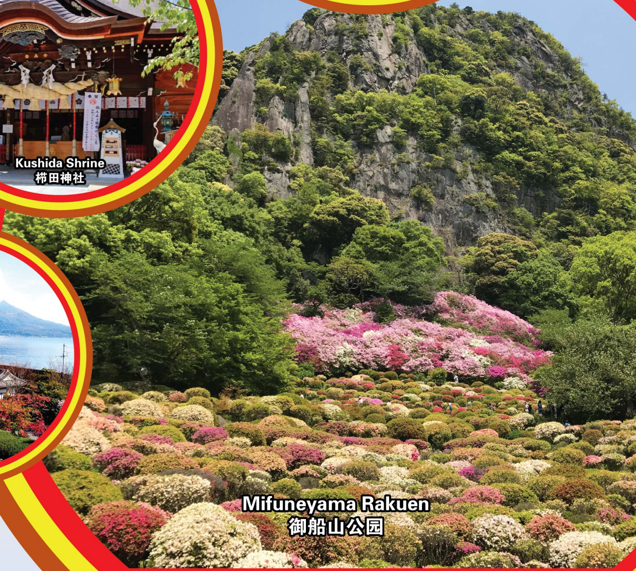
Mifuneyama Rakuen 御船山公園

行程次序・以当地旅社安排为准。 Sequences of Itinerary are subject to local arrangement.