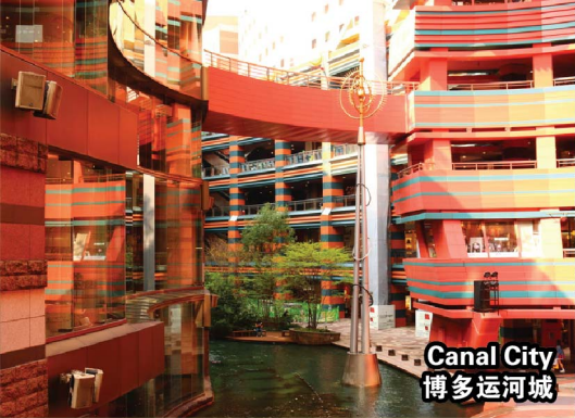
Canal City 博多运河城