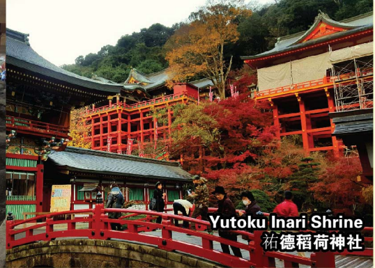
Yutoku Inari Shrine 祐德稻荷神社