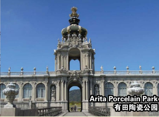
Arita Porcelain Park 有田陶瓷公園