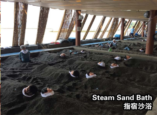
Steam Sand Bath 指宿沙浴