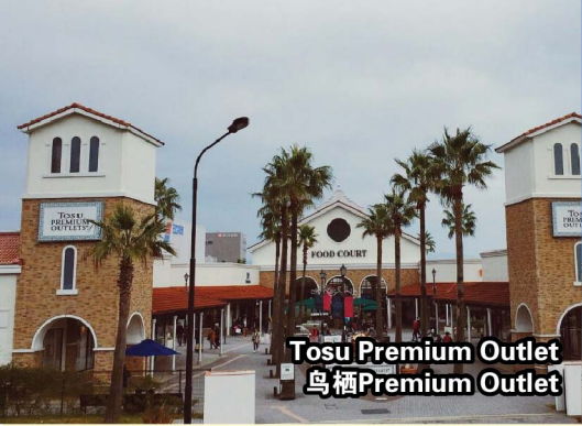
Tosu Premium Outlet 鸟栖Premium Outlet