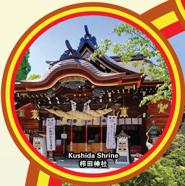
Kushida Shrine 栴田神社