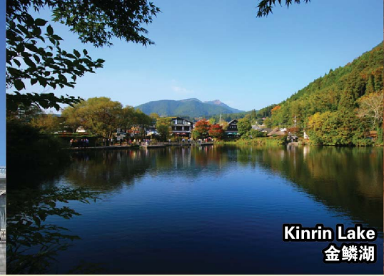
Kinrin Lake 金鱗湖