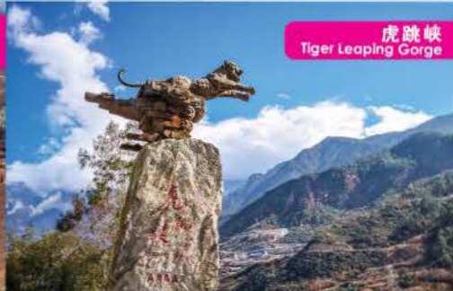
虎跳峡 Tiger Leaping Gorge