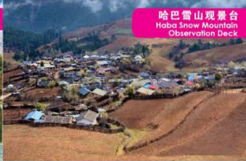
哈巴雪山观景台 Haba Snow Mountain Observation Deck