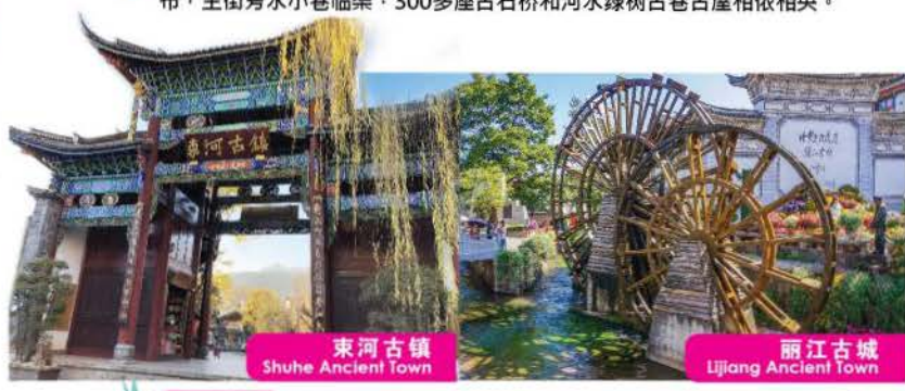
束河古镇 Shuhe Ancient Town