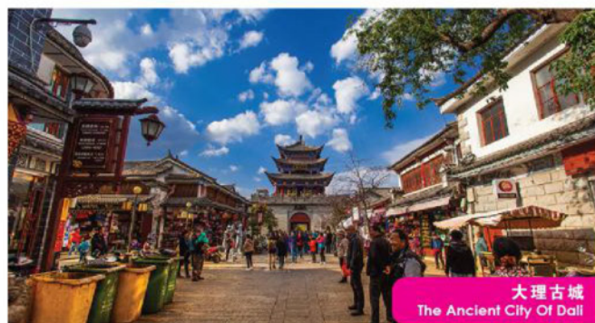
大理古城 The Ancient City Of Dali