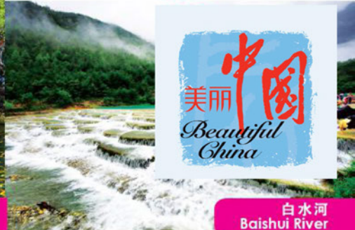
白水河 Baishui River