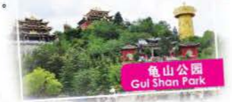
龟山公园 Gui Shan Park