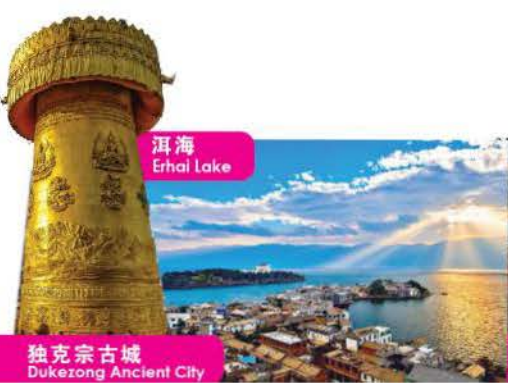
洱海 Erhai Lake