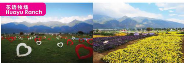
花语牧场 Huayu Ranch