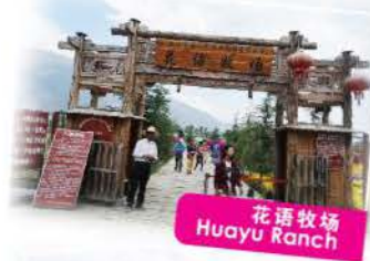
花语牧场 Huayu Ranch