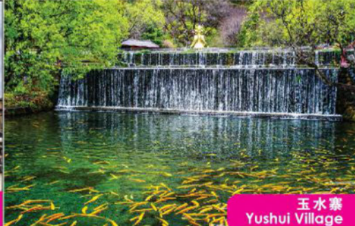
玉水寨 Yushui Village