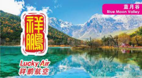
蓝月谷 Blue Moon Valley