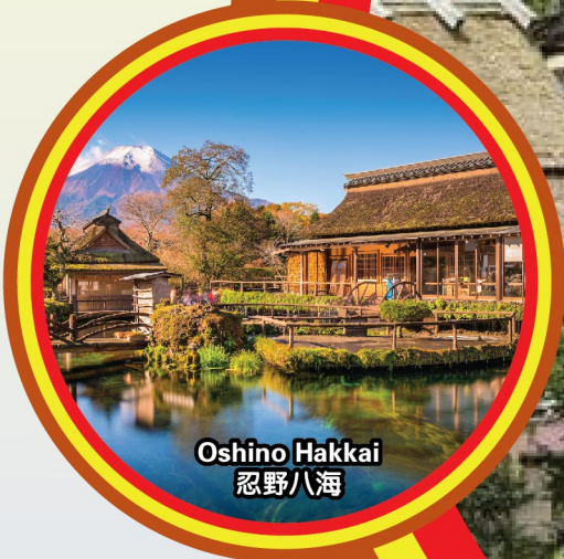
Oshino Hakkai 忍野八海