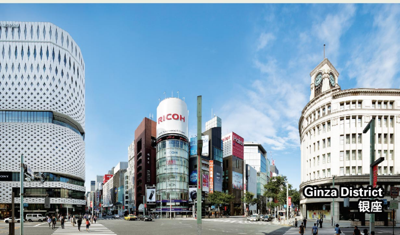
Ginza District 銀座

Special Arrangement: Experience Japanese Tea Ceremony