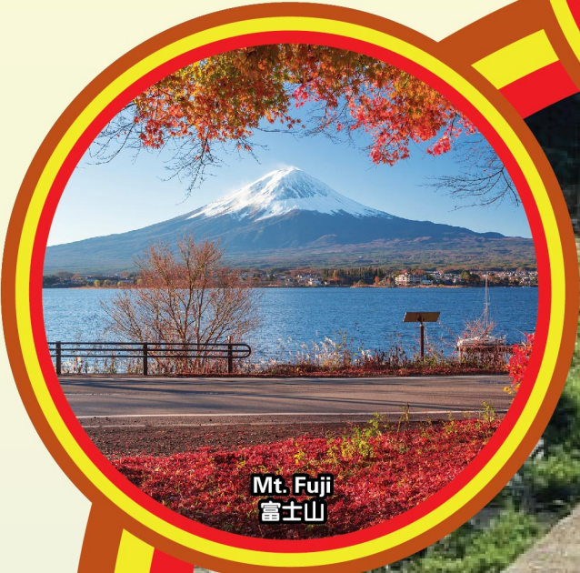
Mt. Fuji 富士山