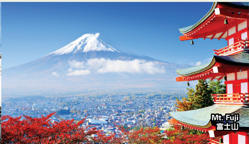
Mt. Fuji 富士山