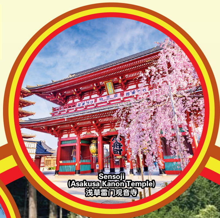
Sensoji (Asakusa Kanon Temple) 浅草雷门观音寺