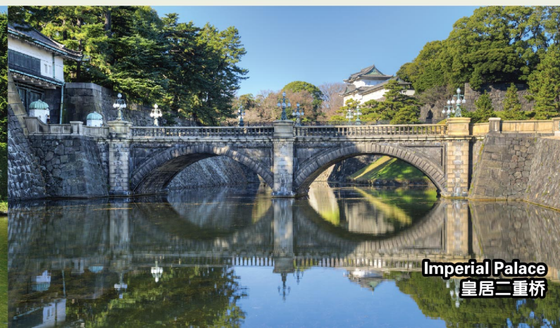
Imperial Palace 皇居二重桥