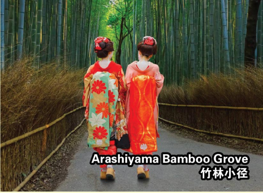
Arashiyama Bamboo Grove 竹林小径