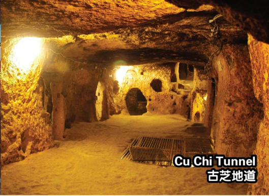
Cu Chi Tunnel 古芝地道