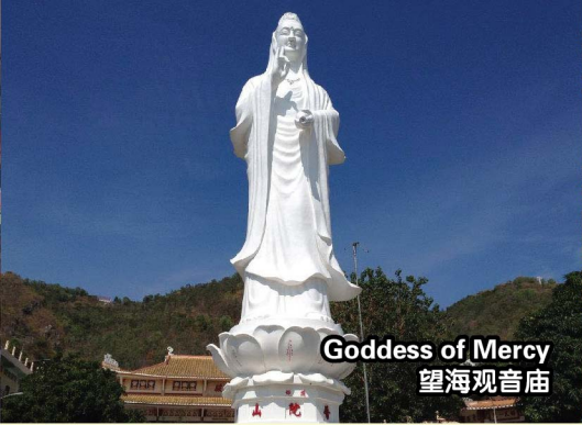
Goddess of Mercy 望海观音庙