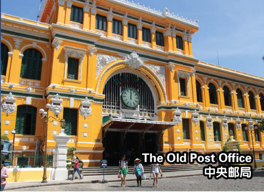
The Old Post Office 中央邮局