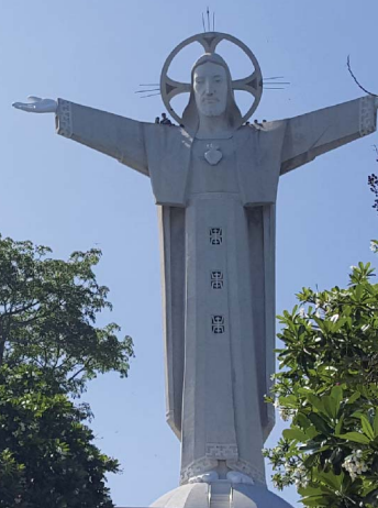
Christ Hill 耶稣山

行程次序，以当地旅社安排为准。 Sequences of Itinerary are subject to local arrangement.