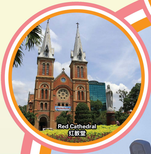
Red Cathedral 红教堂