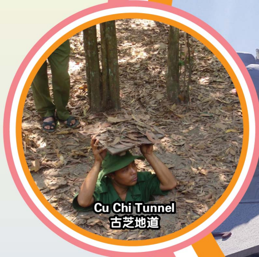
Cu Chi Tunnel 古芝地道