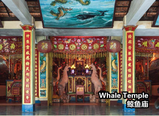
Whale Temple 鲸鱼庙